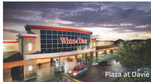
Plaza at Davie