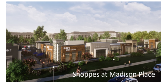
Shoppes at Madison Place

Winn Dixie 61,644 Cilantro Asian Bistro 5,866